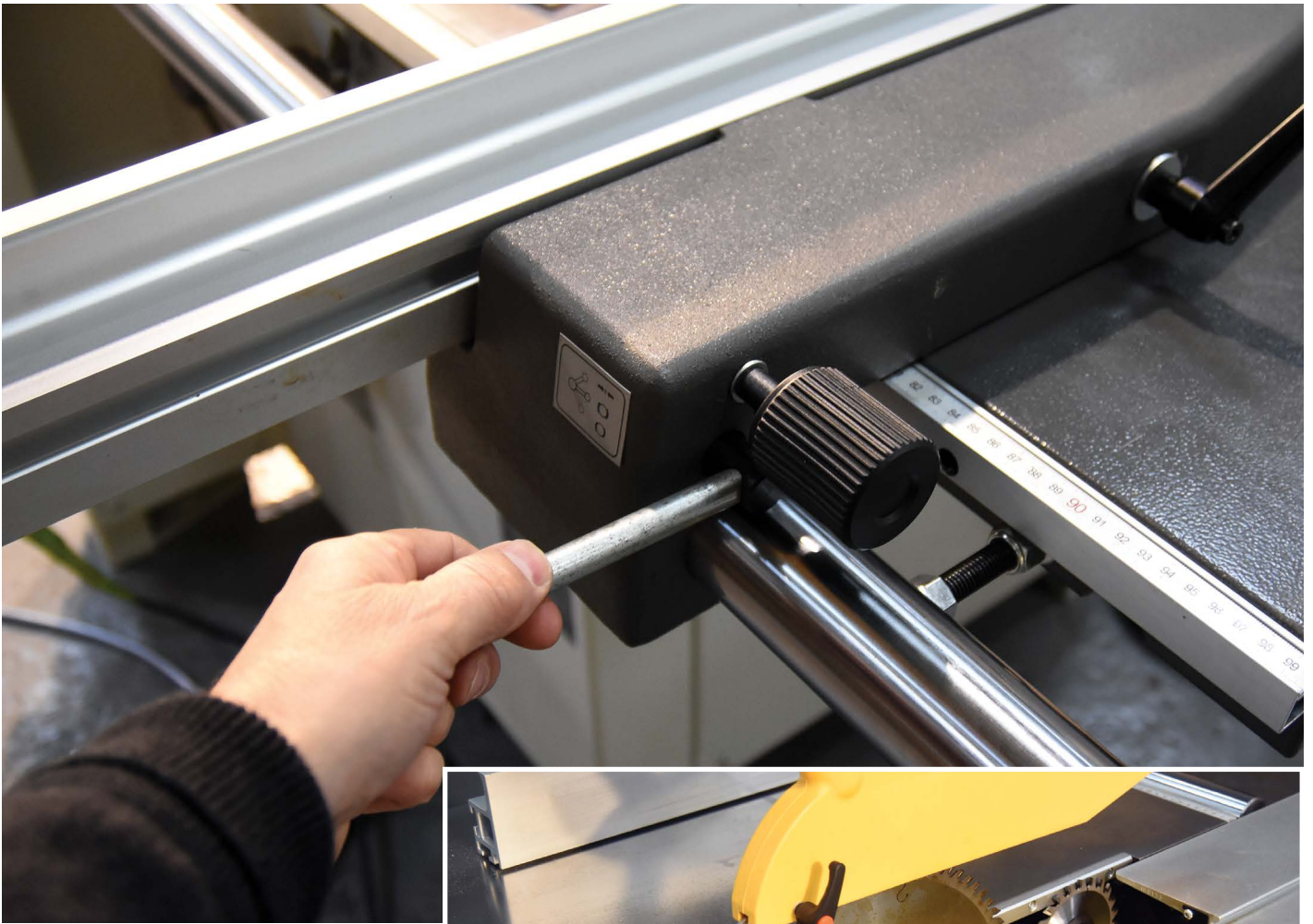
Rock solid fence lock off