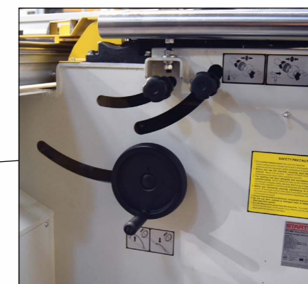
All the settings are via hand wheels

One of the things that's never a deal breaker when buying a machine but you'll wish it was one day is the level of access for routine maintenance. It's a fact of life that extraction ports on tablesaws get blocked and when it happens you invariably end up on the floor with your arm up a pipe, James Herriot style trying to remove the blockage. The TS1's main port is high up on the back of the machine exiting the cabinet in a straight line precisely where any blockage is likely to occur. The cut-out on the cabinet also allows good access to the interior of the machine so you can keep tabs on the dust building up inside the unit. Around the side of the cabinet there's a removable panel that gains access to the motor bay and all the parts that need servicing. As I said, you won't appreciate this until you have reason to put it to the test in which case you can thank me later for this insight. When you need to change blades there's ample room when the guard is dropped to get a spanner and your fist in the void. You may have to remove the crown guard to drop the bar that locks the spindle through the table but loosening a small Bristol lever is the only thing stopping you.