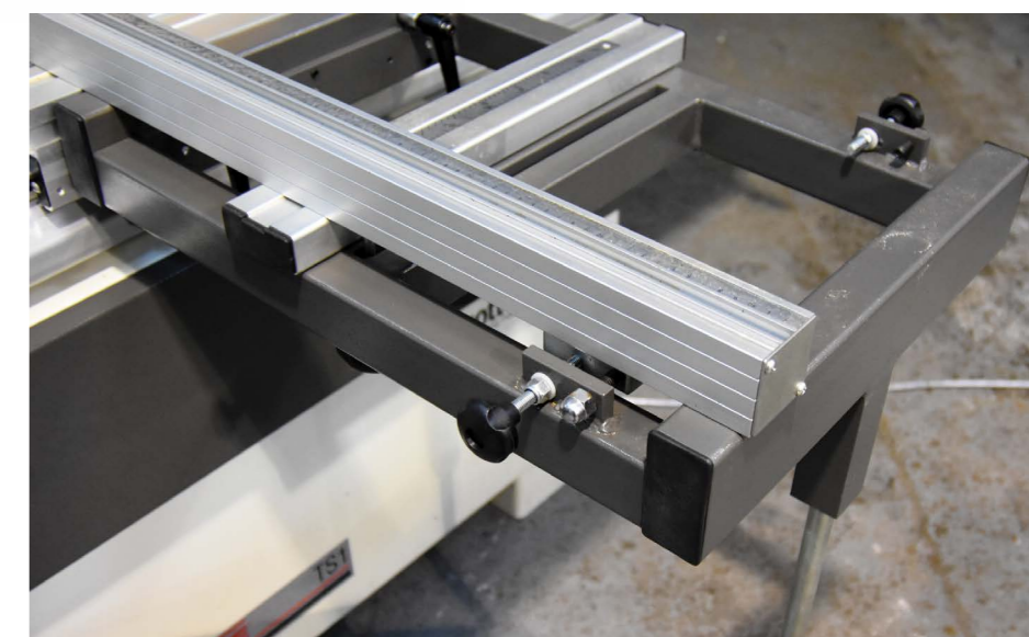
Work either side of the squaring frame fence

The controls on the TS1 are all manual and all the better for it. Flipping the blade from 90° to 45° is smooth in both directions as is the height adjustment for the main blade. Less obvious at first are the controls for the scroll blade to align it left or right of the main blade and raise or lower it completely. Once mastered, lateral adjustment in increments of 0.01mm are well within your grasp. Although the scroll blade has a separate motor so it can be turned off when not in use, the settings remain in sync with the main blade.