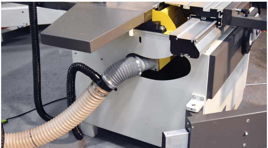
Clear route for waste material

Maximum Blade Size: 315mm Blade Bore: 30mm Scoring Blade Size: 120mm Scoring Blade Bore: 30mm Blade Speed: 4000rpm Maximum Rip Capacity: 900mm Sliding Carriage Stroke: 1250mm Blade Tilt: 45° Maximum Depth of Cut 90°: 102mm Maximum Depth of Cut 45°: 72mm Table Height from Floor: 870mm Motor: 2.5kW Weight: 400kg Size: H860 x W2030 x D1730mm Price: £2799.99 From: www.recordpower.co.uk